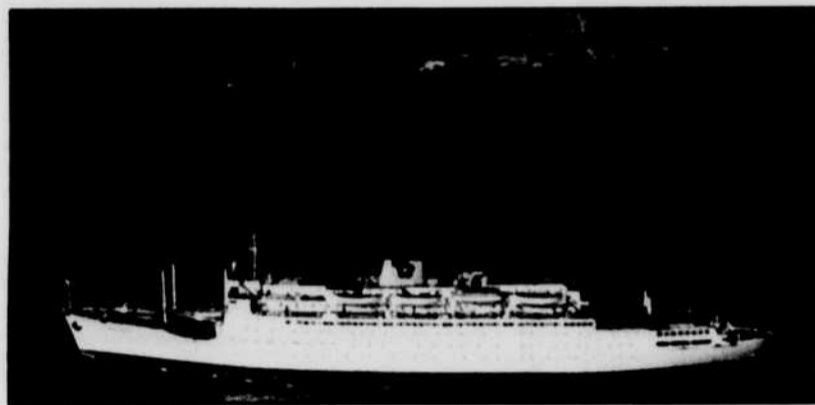
CIRCLE NO. 01

For full information and application call 800-854-0195 / 412-648-7490 in PA, or write Semester At Sea, University of Pittsburgh, 8th Floor, William Pitt Union, Pittsburgh PA 15260. Apply now, then prepare for the learning adventure of your life.