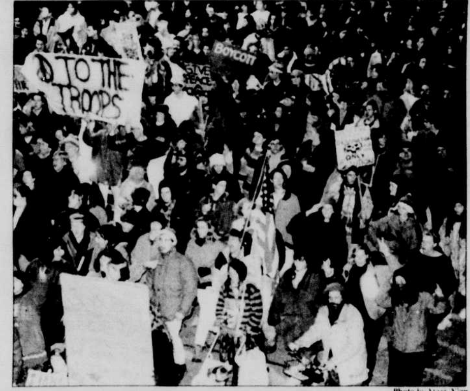
The sea of marchers grew to more than 2,000 strong by the time it turned onto 15th Avenue from Agate Street.

McCarthy said about 200 people marched onto the southbound lanes of