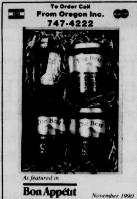
As featured in Bon Appétit November 1990

One large bottle of syrup all dressed up and placed on a bed of color coordinated excelsior inside a gold gift box.