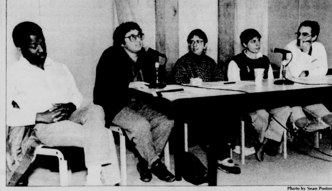
A panel of University and community members discuss perceived discrimination in the law

Southtowne Shops • 2805 Oak Street, Eugene • 686-9201