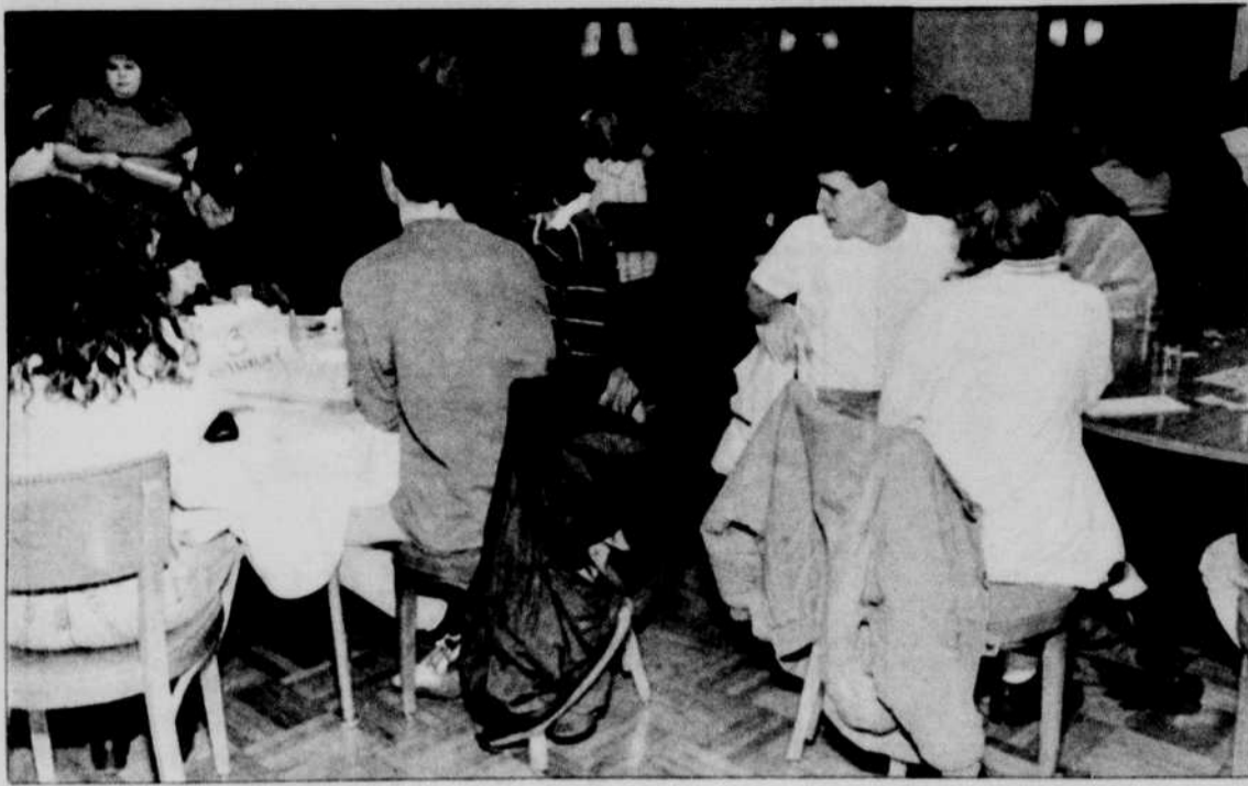
Diners at the Banquet for Hunger experienced "poverty level" meals of rice and water (right) while others at the banquet ate "luxury meals" of spaghetti, vegetables and dessert (left).