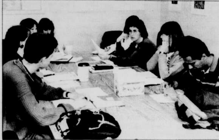
Members of the Unwanted Sexual Behavior task force discuss the safety of international students.

The group has also made a videotape available to international student groups. The Wrong Idea presents different scenarios involving international students in sexual harassment situations with professors and other students. Committee members have offered to serve as facilitators at meetings where the tape is