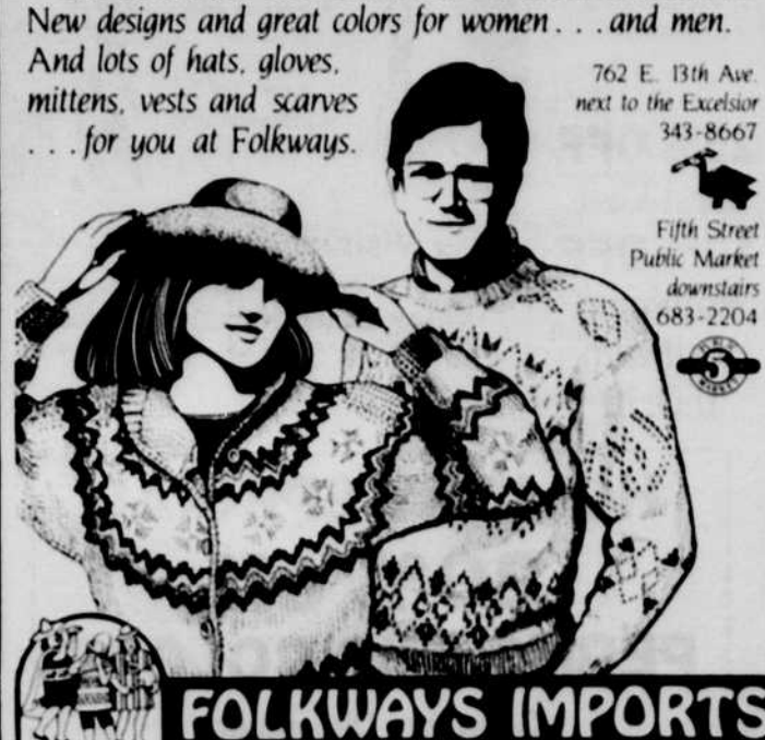
Page 6B, Lifestyles

Our wonderful, warm, handknit wool sweaters are in! New designs and great colors for women . . . and men. And lots of hats, gloves, 762 E. 13th Ave.