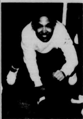
Luv, on a RAY-NY MOM-day STEVE McGARRET saw CRAIG hit his JULES WEN he ran into a SCOTTISH KRIS- MUS tree.