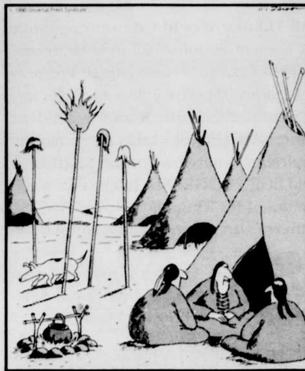
The fate of Don King's great-great-grandfather