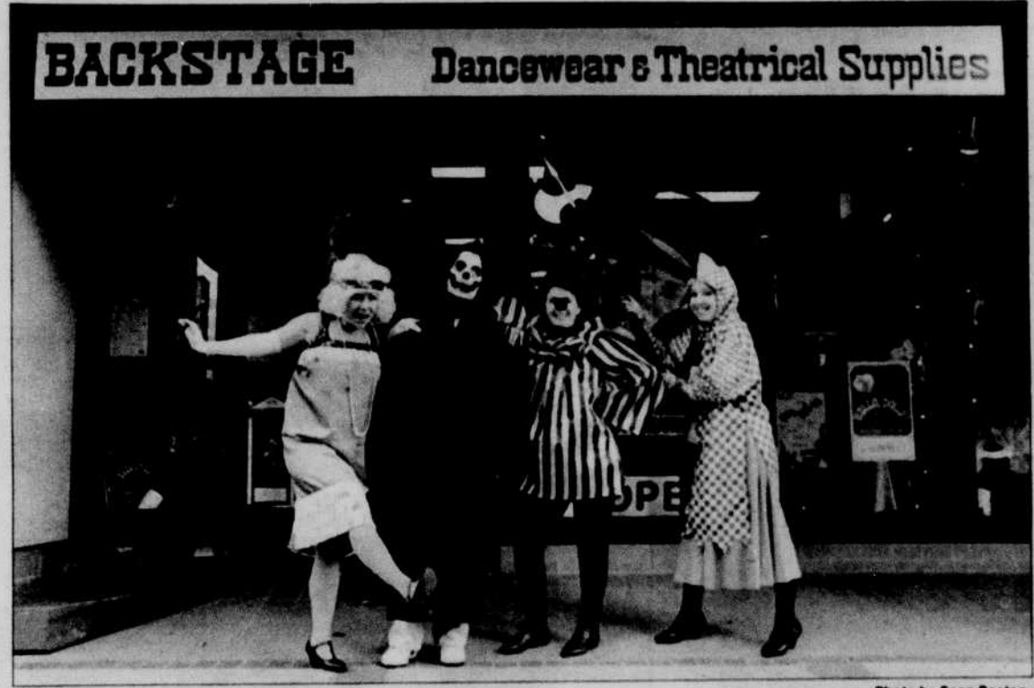
Employees of Backstage Dancewear and Theatrical Supplies show off the variety of costumes that can be made with their store's wares.