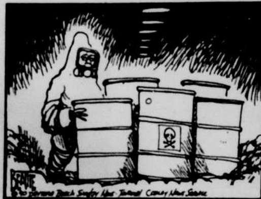
NUCLEAR WEAPONS PLANT WASTE