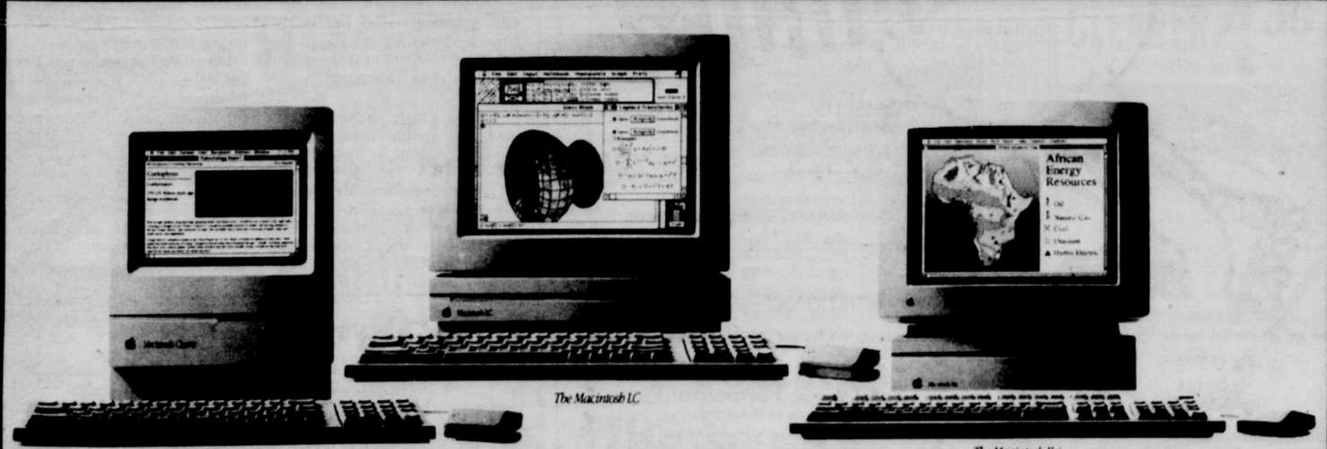
The Macintosh Classic

With Apple's introduction of three new Macintosh* computers, meeting the challenges of college life just got a whole lot easier. Because now, everybody can afford a Macintosh.