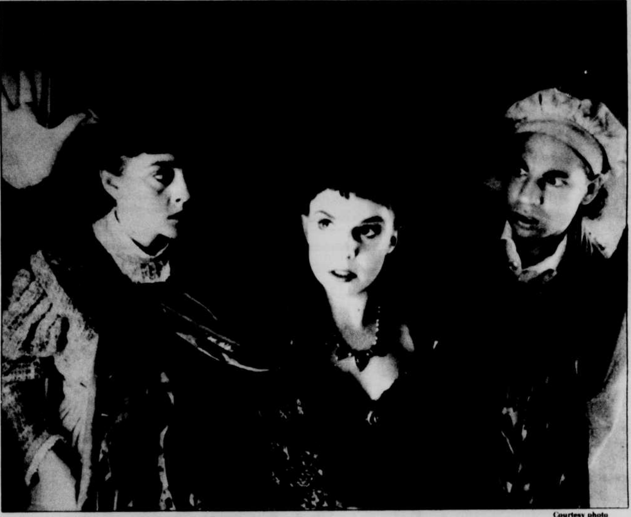
Into the Woods, a sophisticated musical drama featuring fairy tale characters, will be staged at the Hult Center today and Saturday.

Sondheim, who wrote lyrics for West Side Story and Gypsy and the music for A Funny Thing Happened on