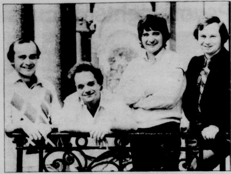
The Takacs String Quartet opens the University Chamber Music Series Oct. 14 at Beall Hall.