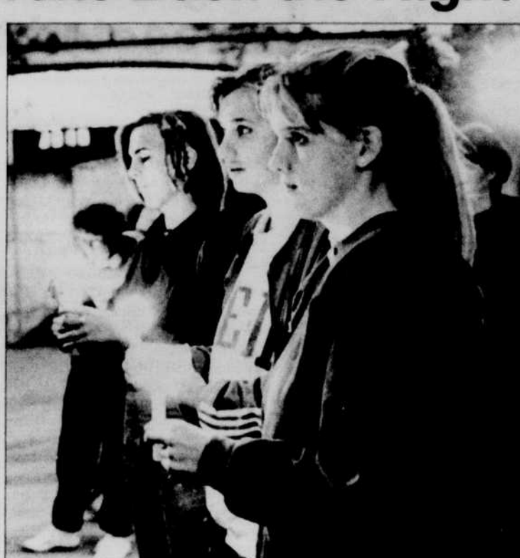
Holding flashlights and candles, about 50 women marched on

trained dogs as part of the rally. Saferun rents dogs to women runners, walkers and joggers for a $25 monthly fee.