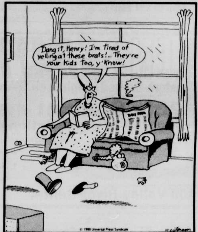
A day in the invisible Man's household