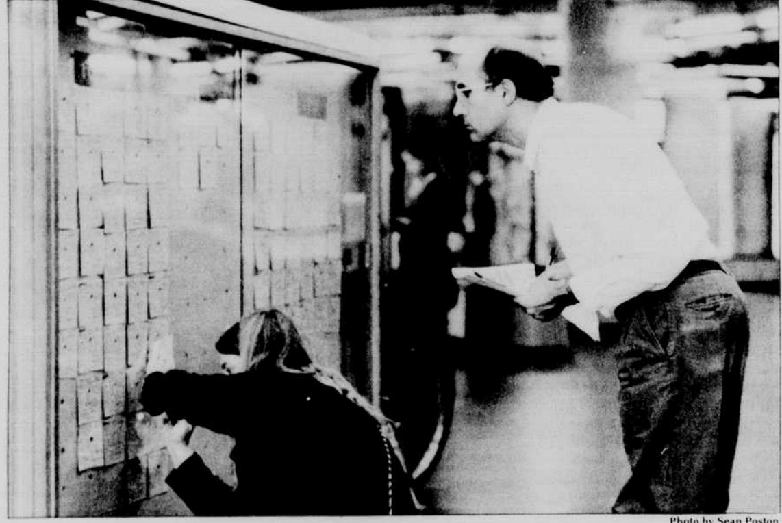
Students hunting for apartments will find that housing is scarce near campus and that rents