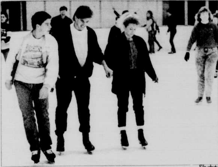
Lane County Ice, which opened Dec. 22, has capitalized on business brought by residents from Canada and the East Coast.