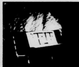
POCKET SOFA & FOAM CORE FUTON DOUBLE $229