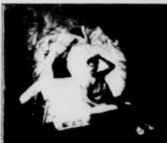
STUDIO SLEEPER & FOAM CORE FUTON SINGLE $169 DOUBLE $189 QUEEN $209