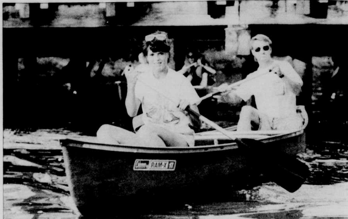
The EMU offers a variety of inexpensive indoor and outdoor activities for students including relaxing canoe trips down the Millrace.