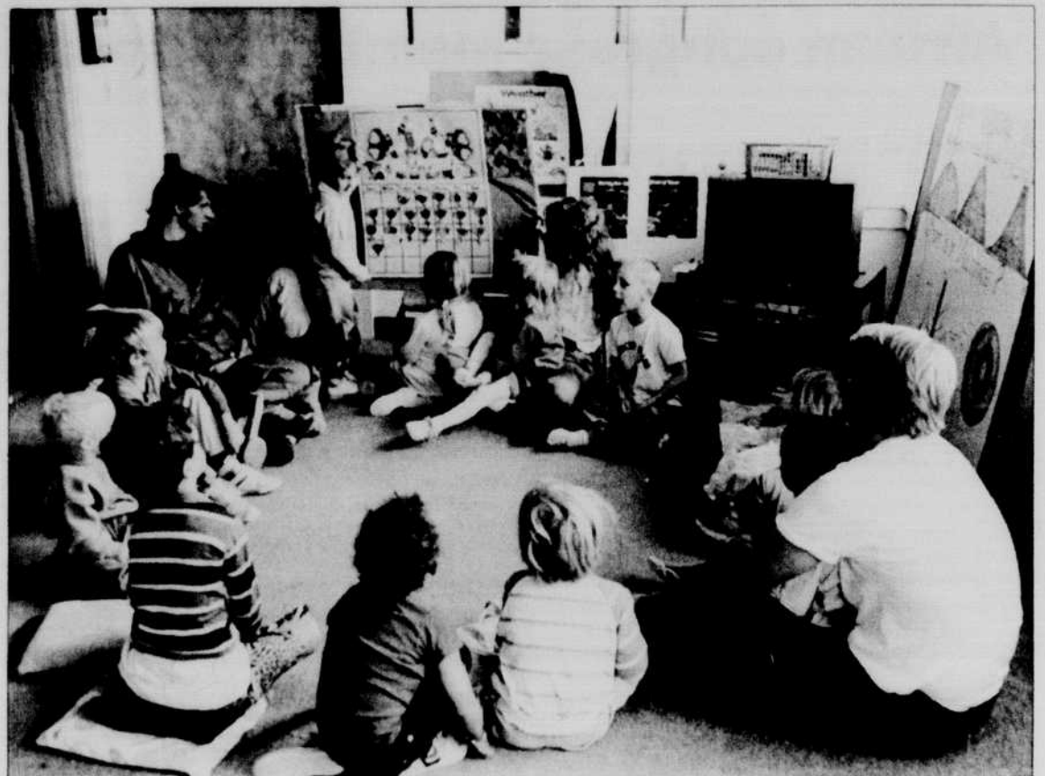
The Amazon Cooperative Child Care Center allows parents to reduce their child care bill by teaching, cleaning, assisting with planning or performing other tasks at the center.