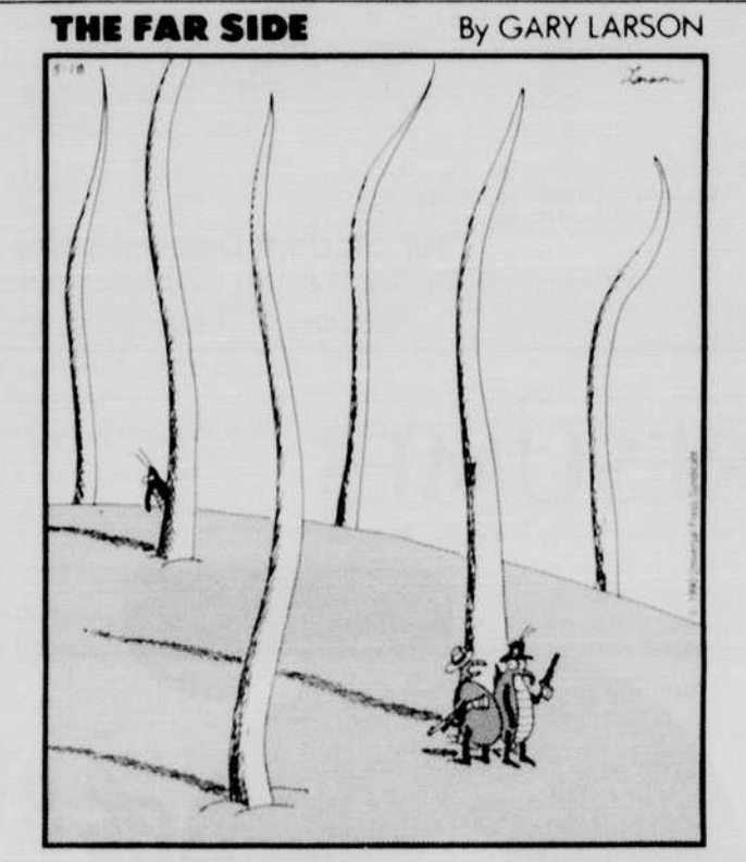
"Listen, before we take this guy, let me ask you this: You ever kill a flea before, Dawkins? It ain't easy."