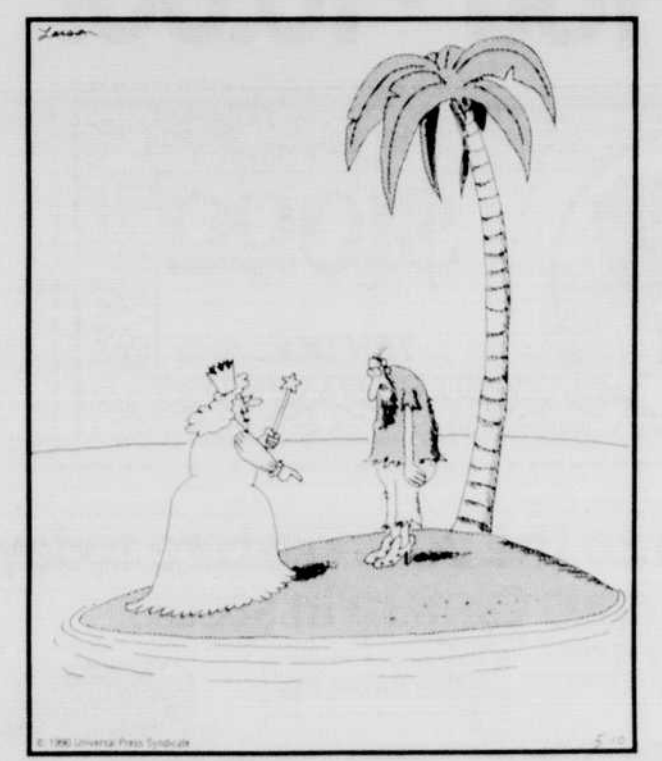
"All this time you've been able to go home whenever you desired — just click your heels together and repeat after me . . . "