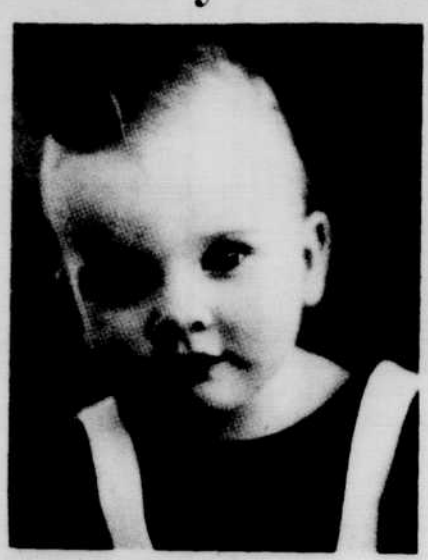
Today, this look doesn't make the grade.

If you are looking for the look to fit the fashion, you've found the place. Tangles offers upscale hair design, right at your fingertips. Call 343-1637 on East 11th or 687-0138 on Willamette for an appointment.