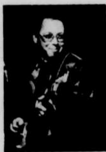
The Lloyd Jones Struggle