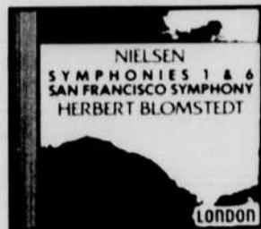
425 607-2 Also Available on Cassette