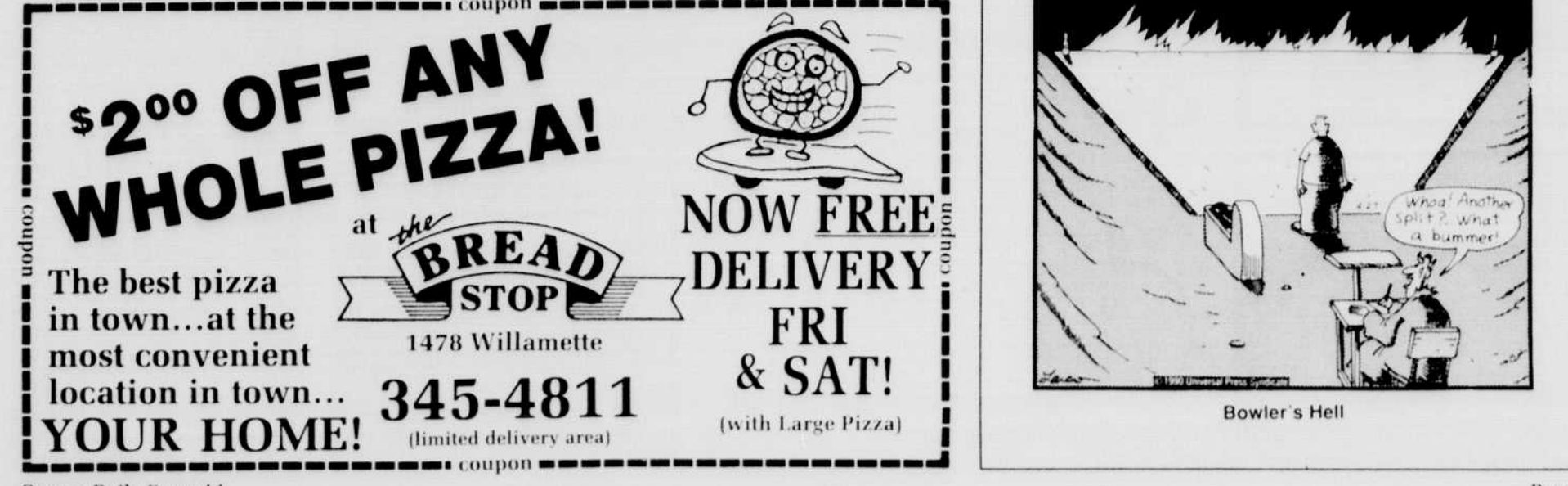
Oregon Daily Emerald