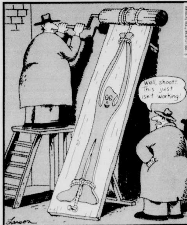
Special Agent Gumby falls into the frustrated hands of the enemy.