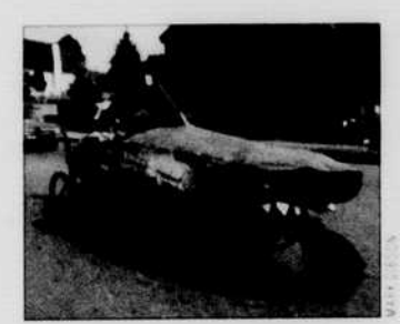
The Kinetic Sculpture Race: Just when you thought it was safe to get back on the streets.

Providence, R.I.—A coat of many shoelaces turned up here last year, and so did a dress made of rattan (palm stems). But garments made of funky materials are only part of this showcase of clothing creations by Rhode Island School of Design students. Fashion critics pick the best 150 designs, which are then modeled in three shows. Tickets are $20 to $45 and go on sale in early April Call 401-331-3511.