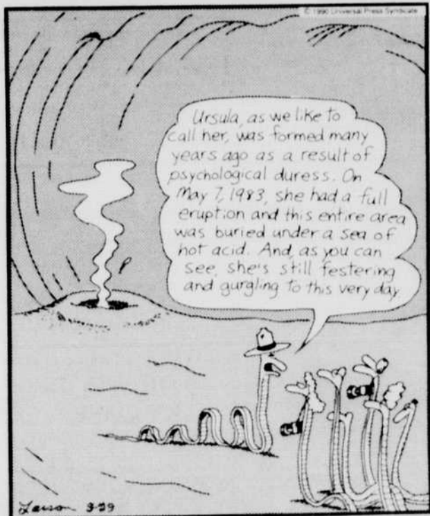
Tapeworms visiting a Stomach Park