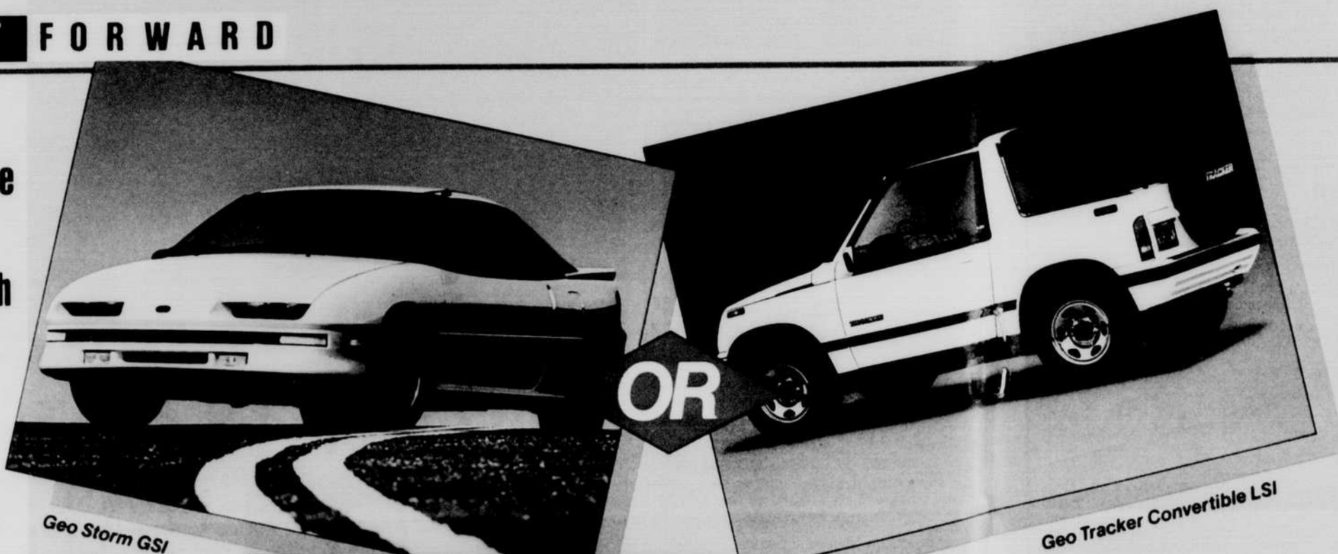
Geo Storm GSI

Take It To The Streets With GMAC. See Details At Right. ▶