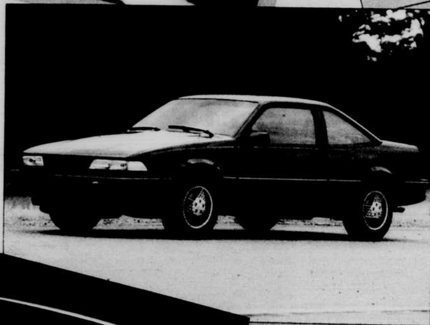
Pontiac Sunbird LE Coupe