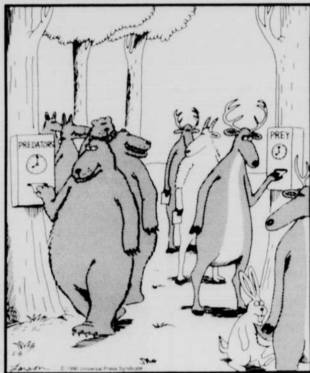
Wildlife day shifts