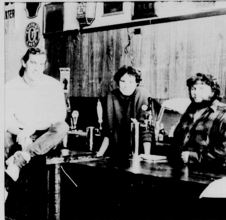
The owners of New Max's hope to blend the old comfort of the tavern with a more diverse crowd.

Gone are the mahogany benches and fir tables, but New Max's Tavern is open for business and basically the same place.