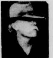
H. Highwater Powers