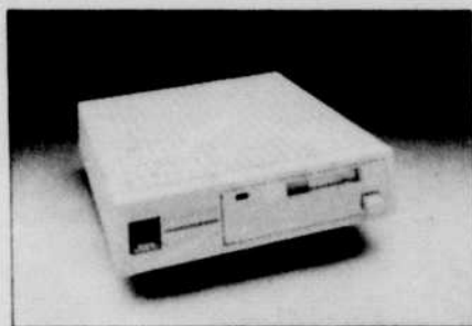
Hi Performance Tape 60 or 150 SCSI Tape Drive for MAC