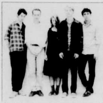
In A Benefit For Parr Tower