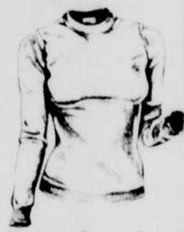
Similar to Picture Shown

We also carry the largest selection of performance rainwear