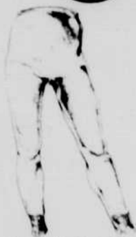
Similar to Picture Shown