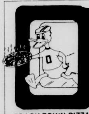
Kitchen help $4.25 per hour fast paced work, part-time, flexible hours. Apply in person 1809 Franklin BLVD. TRACK TOWN PIZZA

TRACK TOWN PIZZA Pizza delivery driver earn $5.8.00 per hours part-time flexible hours. No experience necessary. Must have own care and insurance. Apply in own care and insurance. person 1809 Franklin BLVD.