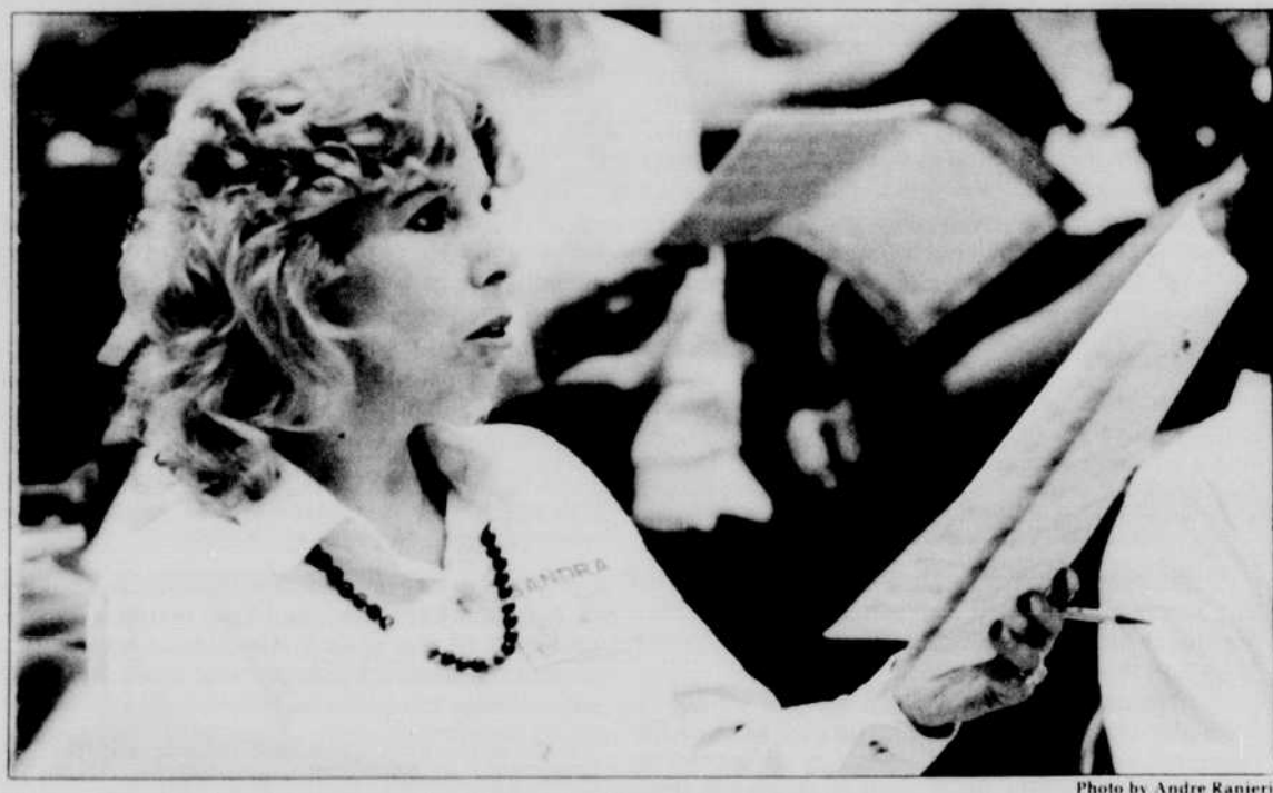
By performing local concerts, the Women's Choral Society raises money for two music student scholarships per year.