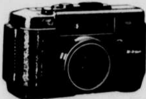
Nikon Action • Touch

• Autofocus • Waterproof Down to 10 Feet • Nikon Inc. Limited Warranty Included