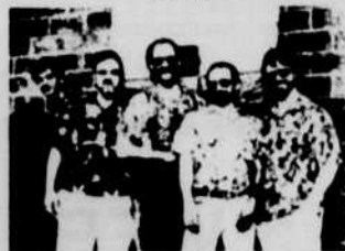
Rockin' Relics Rock Til' You Drop