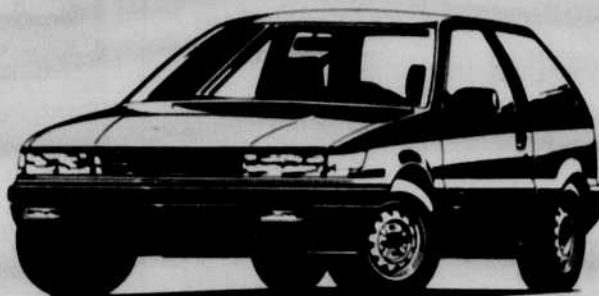
1989 COLT. IMPORTED FOR PLYMOUTH

$8,395* BASE M.S.R.P. - 750** FACTORY CASH BACK - 400† COLLEGE GRADUATE CASH REBATE $7,245