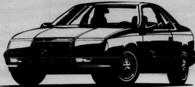
1989 CHRYSLER LE BARON COUPE

$13,995* BASE M.S.R.P. - 300** FACTORY CASH BACK - 400† COLLEGE GRADUATE CASH REBATE $13,295