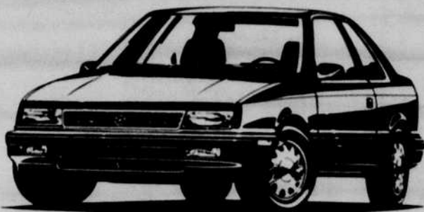
1989 PLYMOUTH SUNDANCE

$11,495* BASE M.S.R.P. - 1,000** FACTORY CASH BACK - 400† COLLEGE GRADUATE CASH REBATE $10,095