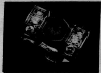
14K Garnet and Diamond Ring