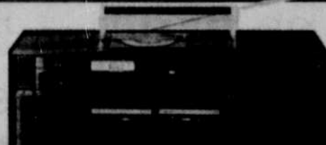
AIWA CA-DW95 Component System