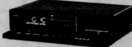
AIWA AD-R550U Cassette Deck