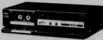
AIWA AD-S10 Cassette Deck