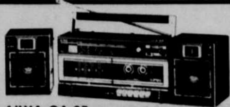
AIWA CA-25 Portable Stereo