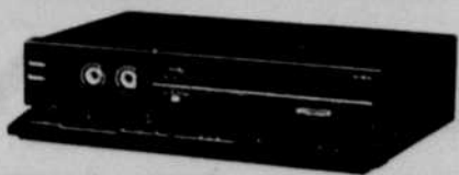
AIWA AD-R30 Cassette Deck