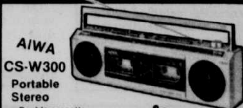
AIWA CS-W300 Portable Stereo