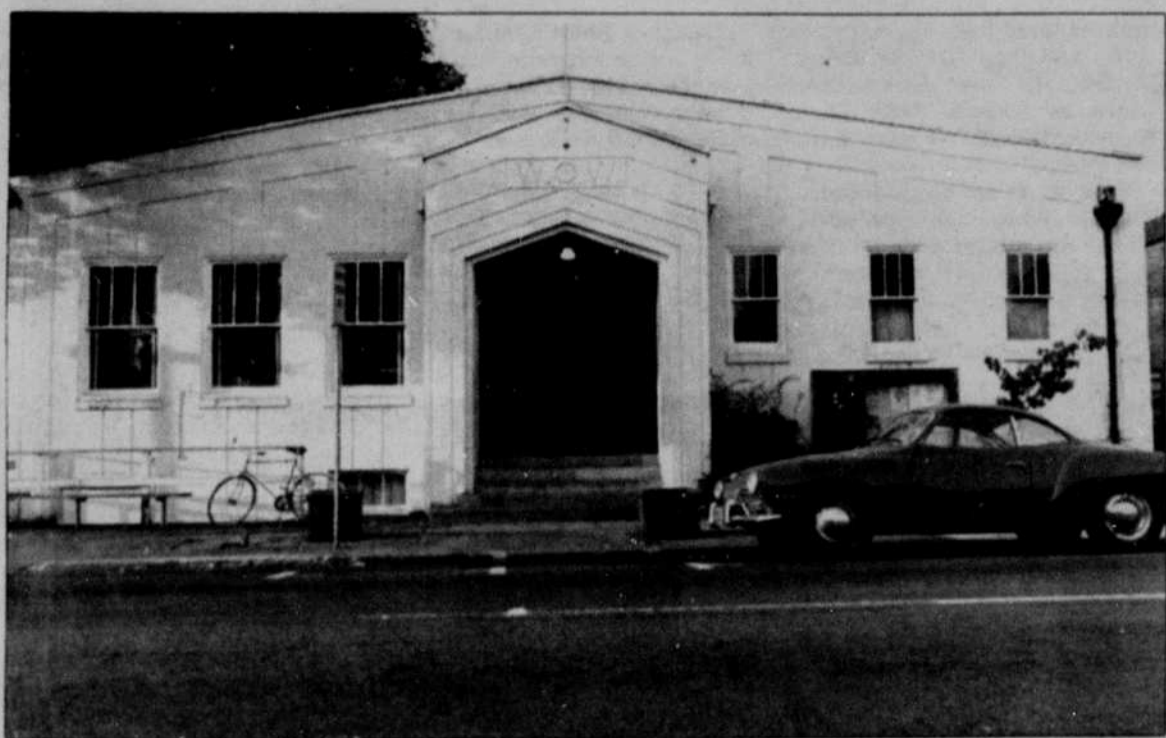
WOW Hall, or the Community Center for the Performing Arts, is a historic Eugene landmark built in 1932. It has always been used as a gathering spot for the local community.