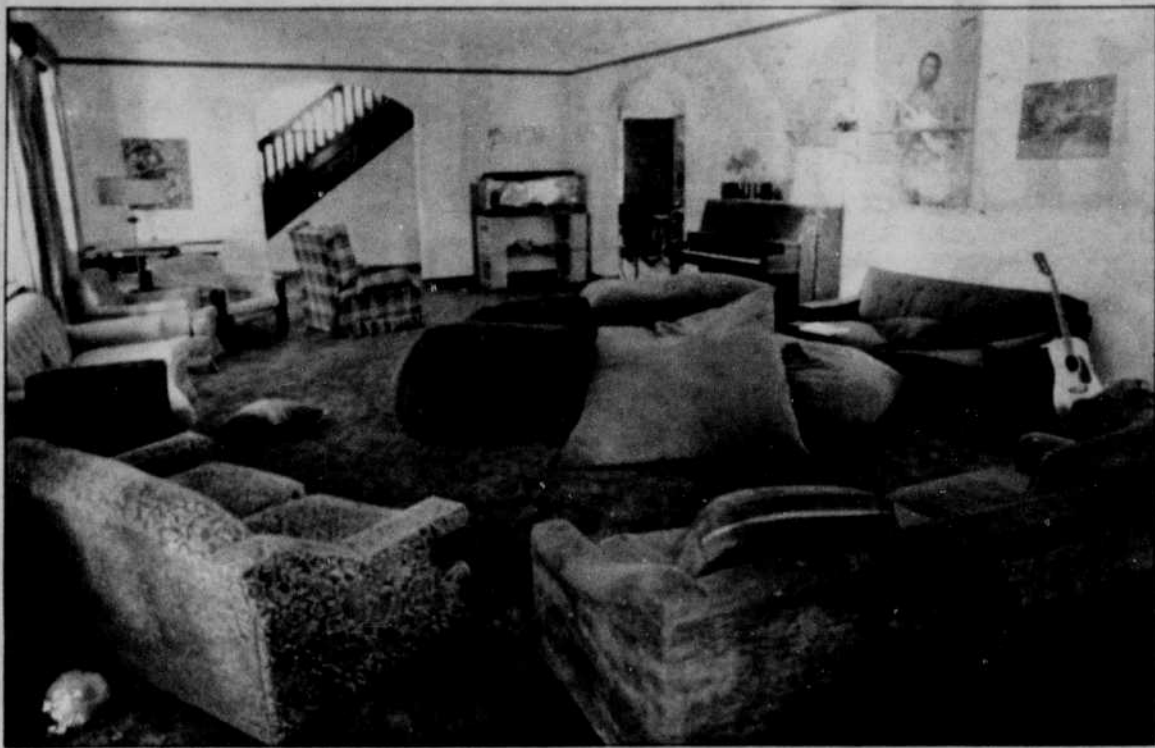
The Campbell Cooperative is one of the many housing options students at the University have open.

office is open weekdays and weekends to better serve students interested in finding housing. Their service starts with the bulletin board that stands outside the office. It consists of listings for almost every form of housing available.