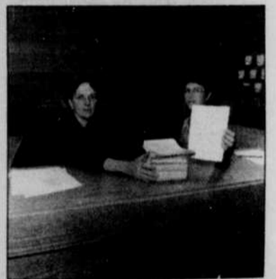
File Photo Keep Eugene Nuclear Free presented more than 1,000 letters to the City Council.

The ordinance passed with 59 percent of the vote during the November, 1986 general election, allowing Eugene to