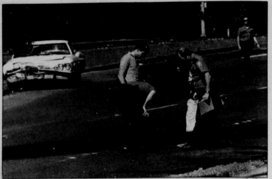
Eugene police investigate the scene of a fatal accident on Franklin Boulevard which claimed the lives of three pedestrians in August. The vehicle involved in the accident (left) came to rest facing oncoming traffic.