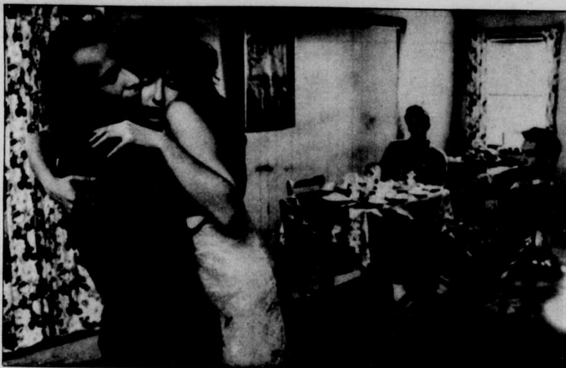
Roberto Benigni and Nicoletta Braschi share a tender moment in "Down By Law," a comedy written and directed by Jim Jarmusch.