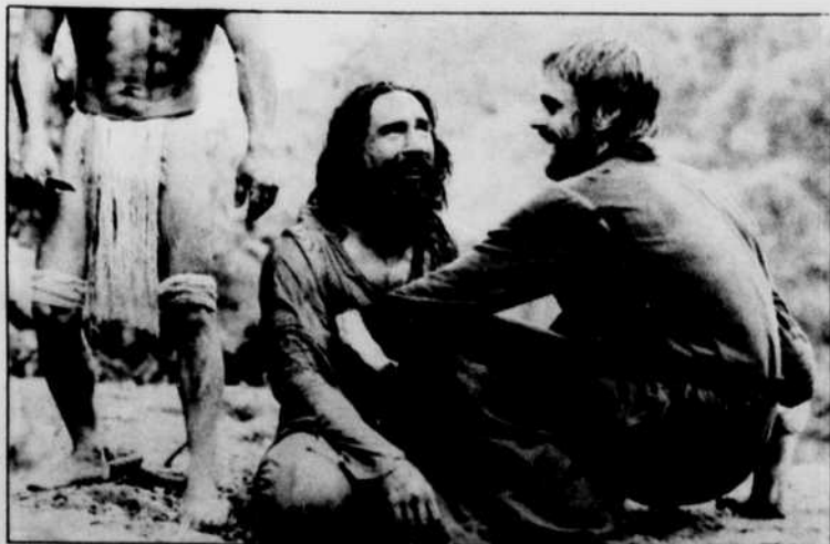
Rodrigo Mendoza (Robert De Niro), center, achieves spiritual conversion with the help of Father Gabriel (Jeremy Irons), right, in a scene from "The Mission."

"The Mission" is a fine picture in the classic tradition of quality set by the films of David Lean, Carol Reed and their epic cohorts.