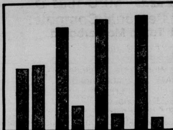
Total Enrollment (17,142)

Other information listed in the student profile but not listed here includes course enrollments, academic performance, degrees and certificates awarded and a profile of the entering freshman class.