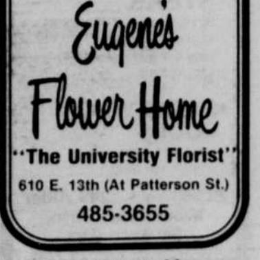
Oregon Daily Emerald

We have poinsettias in all sizes to gladden holiday hearts. Make us your headquarters for floral gifts this Christmas. Call or stop in today. Time is growing short.